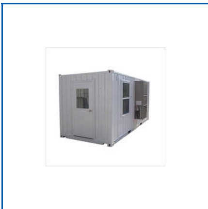
STEEL OFFICE CONTAINER