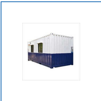
PORTABLE OFFICE CABINET