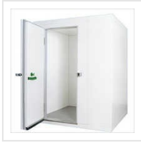
Modular Cold Room