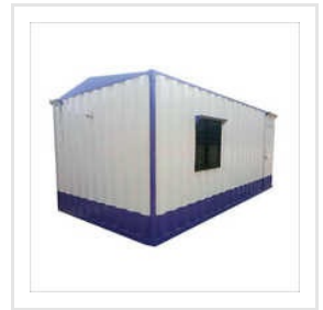
Portable Security Cabin