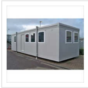
MS Portable Cabin