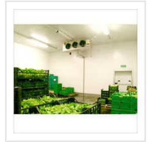
Cold Storage Room