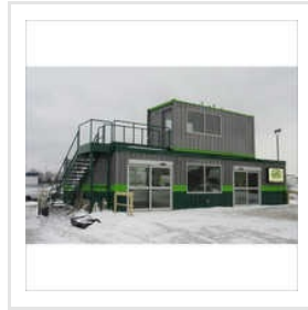
Commercial Portable Cabin