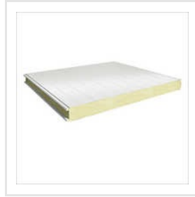
Insulated Wall And Roof Panel