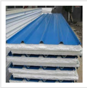
Polystyrene EPS Panel