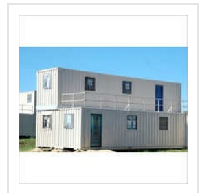
Steel Prefab Workers Accommodation