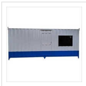
Office Container Cabin