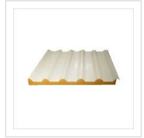
PUF Insulated Panel