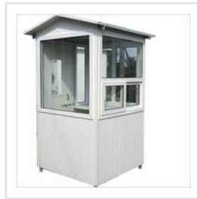
MS Guard Hut