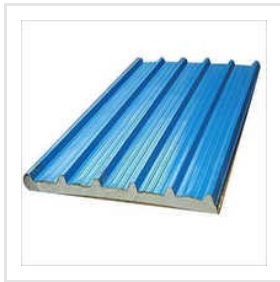
PUF Panel-Puf Sandwich Panels