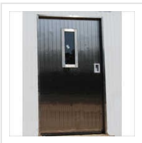
Commercial Cold Room