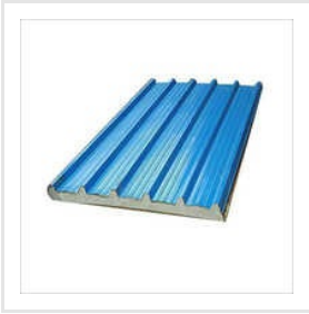
Roof PUF Panel