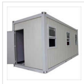
Prefabricated Solar Inverter Room